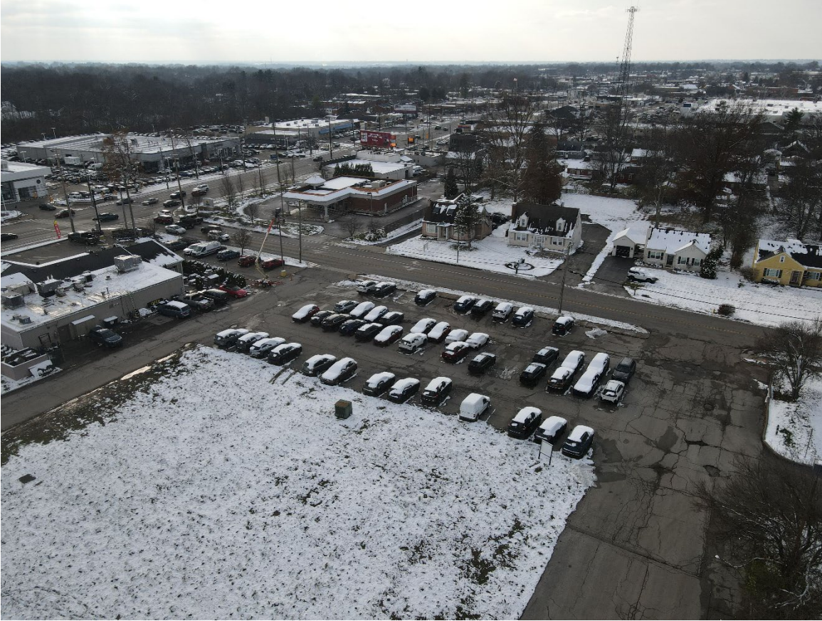
Drone photo looking at both entrances on Nagel Road to the site