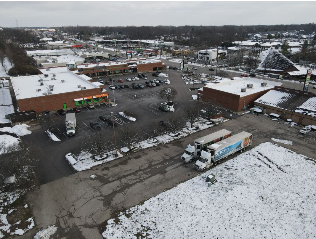
Drone photo showing adjacent shopping center with two cross access points