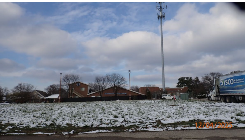
Looking north towards adjacent office uses