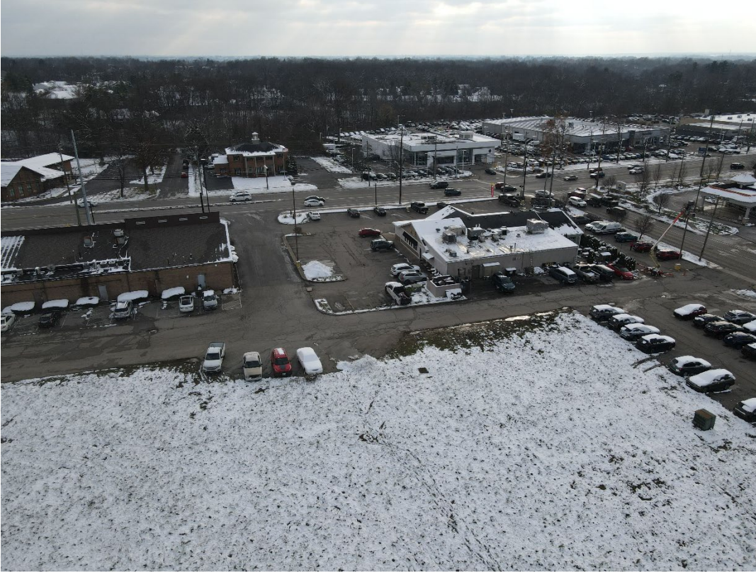
Drone photo showing the cross access from the properties on Beechmont Avenue to the site