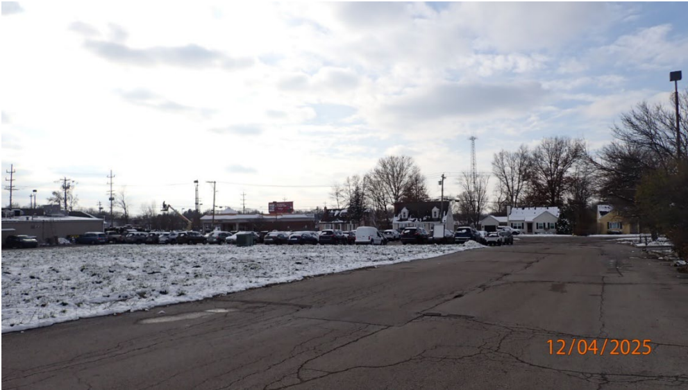
Looking at the Northern most drive on Nagel Road