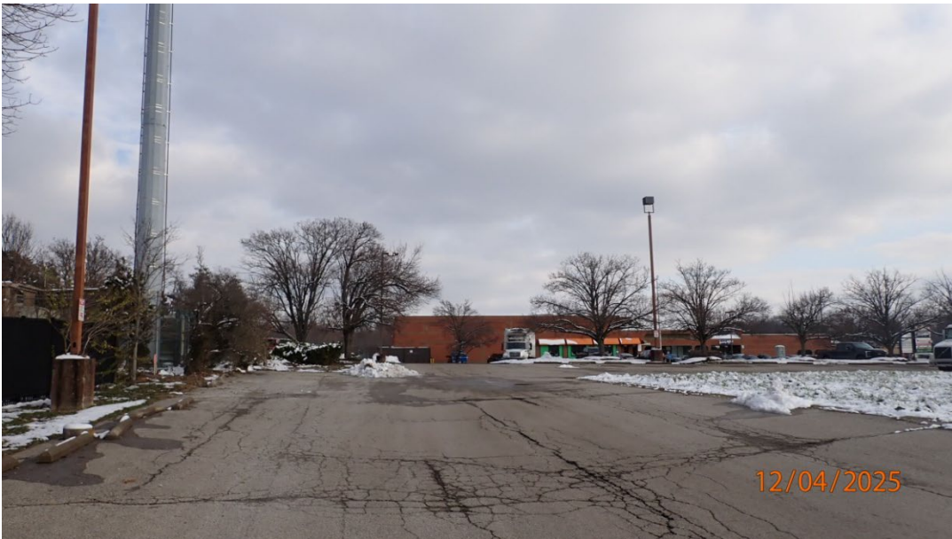
Looking east to the adjacent shopping center and cross access