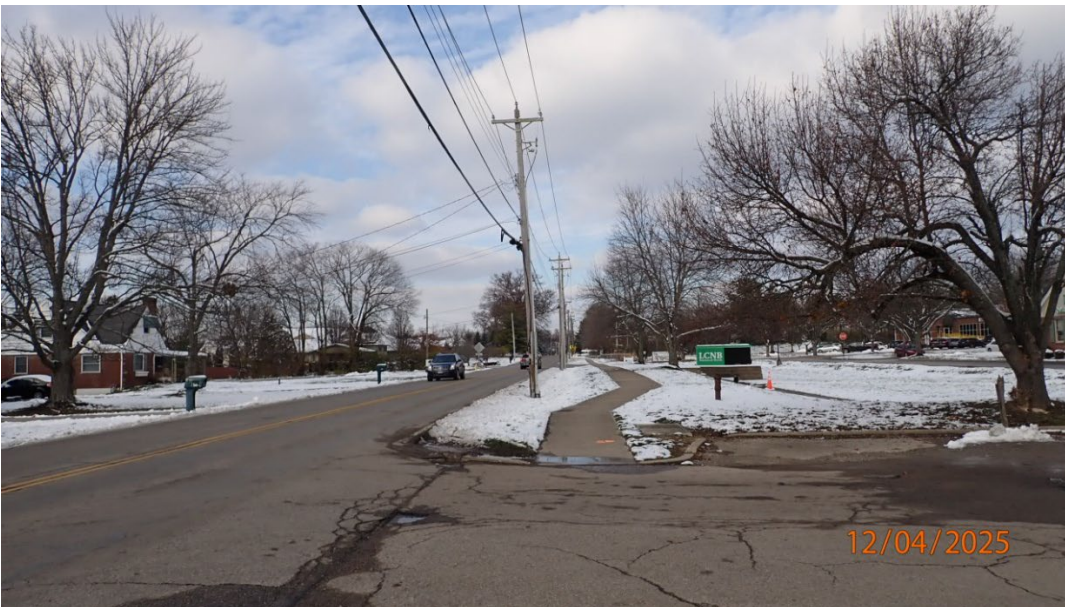
Looking north on Nagel Road, including adjacent businesses and sidewalk