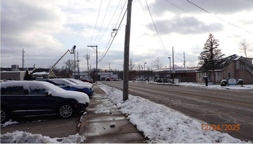
Looking south towards Beechmont Avenue, including existing sidewalks