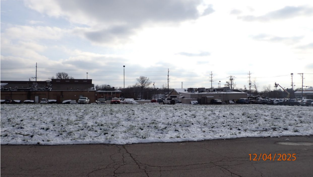
Looking south towards Beechmont Avenue